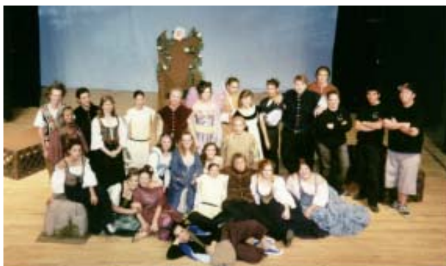
Cast and Crew of THE WINTER'S TALE