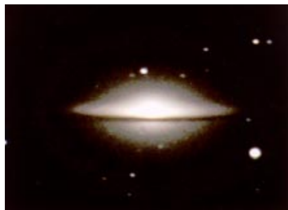
M104 Sombrero Edge-on Spiral Galaxy