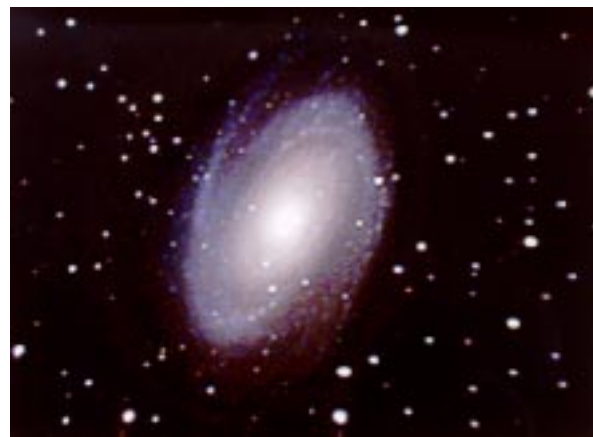
M81 Spiral Galaxy