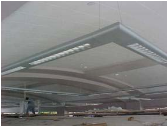
Shows the ceiling finishes of the clerestory. Ceiling tile, soffit paint, fire sprinkler finishes & suspended light fixtures are installed.