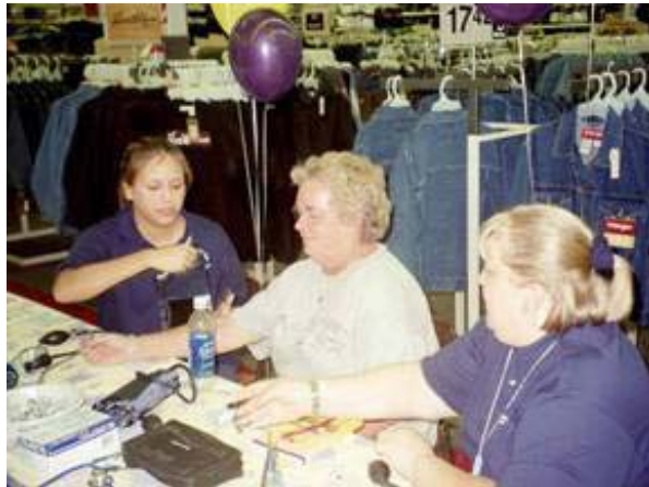
Wal-Mart Women's Health Fair on September 19 & 20, 2003