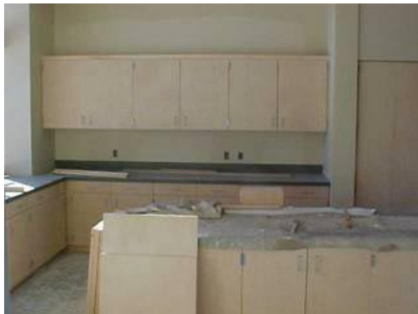
Cabinets in work room

Some of the casework has been installed on the west end of the building. The final grading of the parking lot has been accomplished and some grading around the building has taken place. The ceiling tile is being installed.