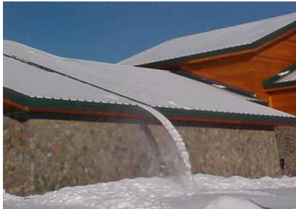
The metal roof does a GREAT job of shedding snow.