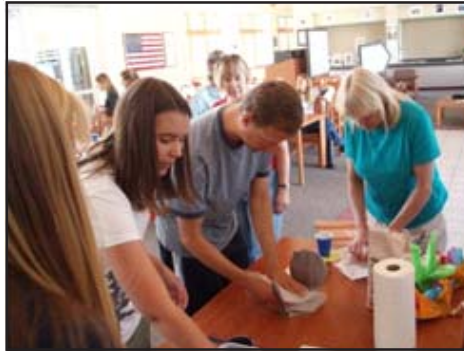
Pictured: Spanish Students celebrating the last day of the Intensive Spanish Summer Program during the Fiesta!