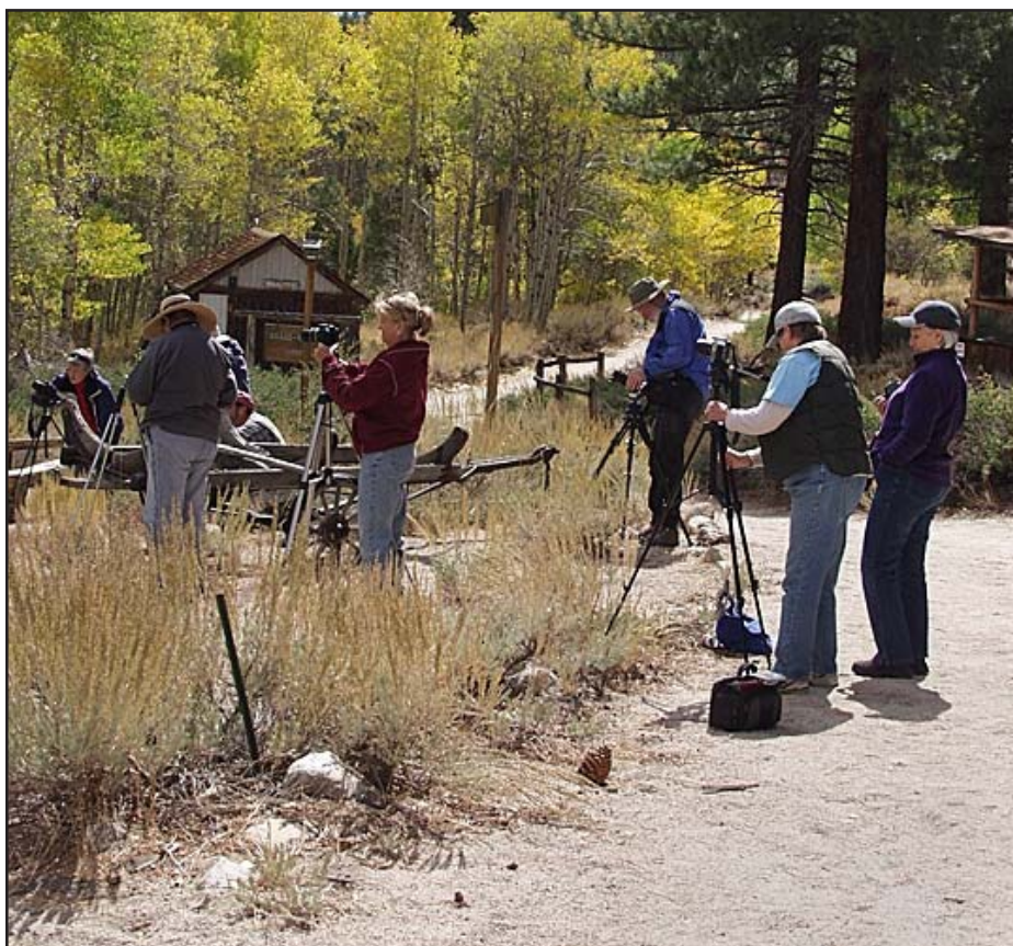
Participants from a past Burger's Sierra Retreat Photography Workshop