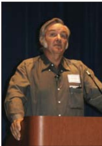
Mr. Burt Rutan