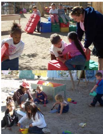
Teachers with their childcare students

The Child Development Center provides quality child care services to both college students and the community. They are a state funded program which lends care to children ages 3 months up to the start of kindergarten. Service is available from 7a.m. to 5:30 p.m., Monday through Friday.